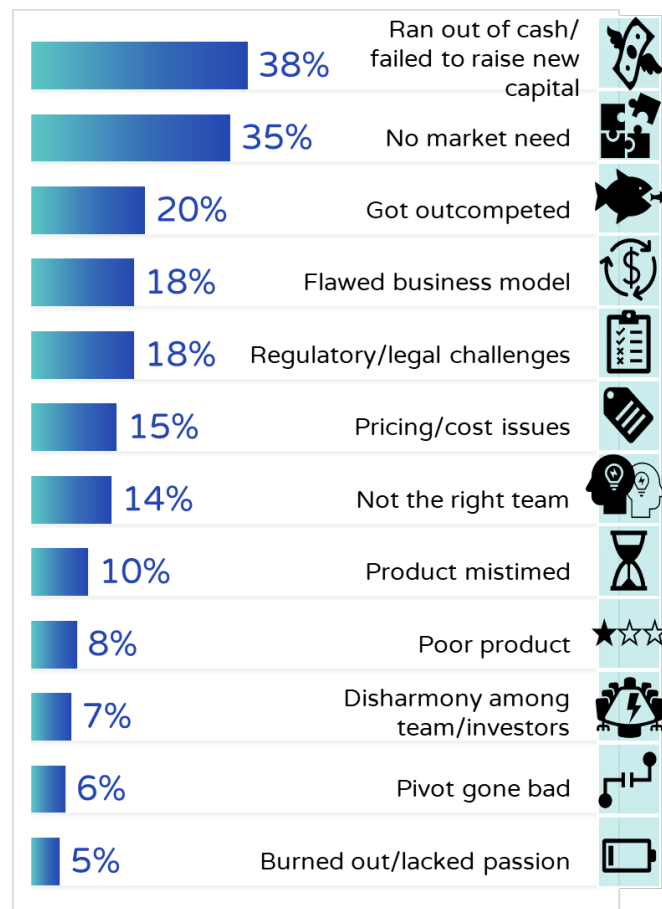
Figure 2: 12 Reasons Startups Fail